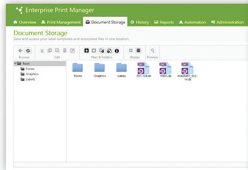
Centralized and secure document repository

Comply with industry standards, control your labeling environment, and quickly respond to label change requests.